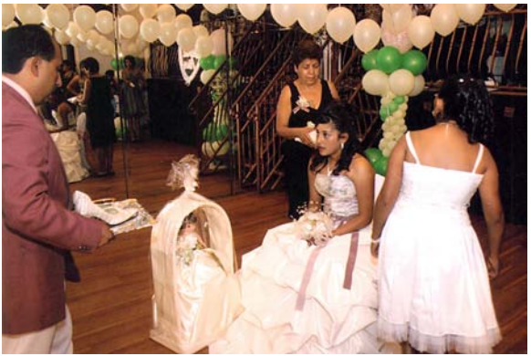
Receiving the last doll and switching to high heels

maids of honor. Everyone is dressed up formally, with the fifteen year old girl wearing a puffy dress that makes her stand out from everyone else. At this mass, the quinceañera is accompanied by the head chamberlain (chambelan), several other chamberlains, the maids of honor (damas), her parents, and her godparents (padrinos). The quinceañera, chamberlains, and maids are all dressed in formal attire. With the quinceañera uniquely dressed, the chamberlains and maids wear matching