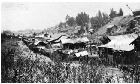
Fickett Street Colony

Boyle Heights over the years. They all came to live here because they were pretty much forced to. The Jewish community arrived from Eastern Europe in the early 1900s. By the 1920s, much of the Los Angeles Jewish community had moved to Boyle Heights. They were not satisfied with the society in Los Angeles and decided they wanted a separate cemetery. They later decided to move out of Boyle Heights to places like the San Fernando Valley, Westchester, the West Side,