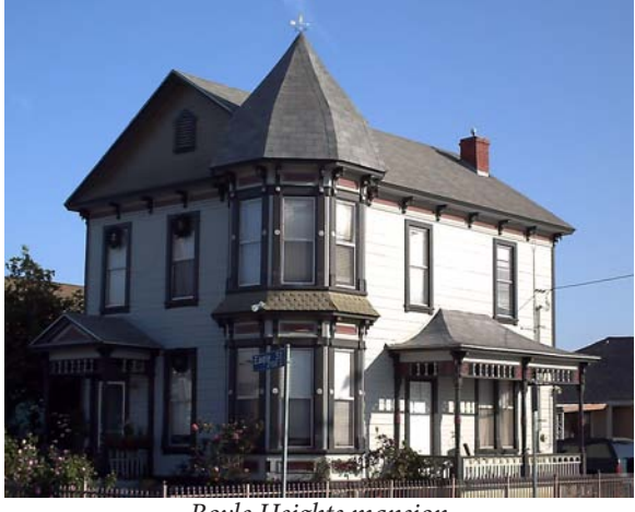
Boyle Heights mansion

HAVE YOU EVER STOPPED TO LOOK and see your surroundings? Our surroundings are not just about light posts or recreational parks, nor are our buildings just "blocks." Our architecture has history and culture behind it. Our modern architecture has a story that unfolds and traces back to our early ancestors who migrated