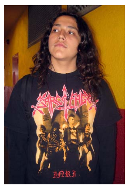
Student wearing a band t-shirt

ways. The Melbourne Shuffle is a fast sideways heel-toe movement on one foot twisting at the ankle. Spins, arm pumps, and kicks can be added. It is the most common way to dance. Techno is a party must have! Techno is important here in Boyle Heights because it makes people feel more alive.