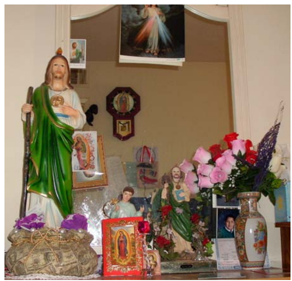
Religious display in a private home

Buddhism has small number of followers in our community. The approximately 150 member families of the Rissho Kosei-Kai temple come from various neighborhoods.