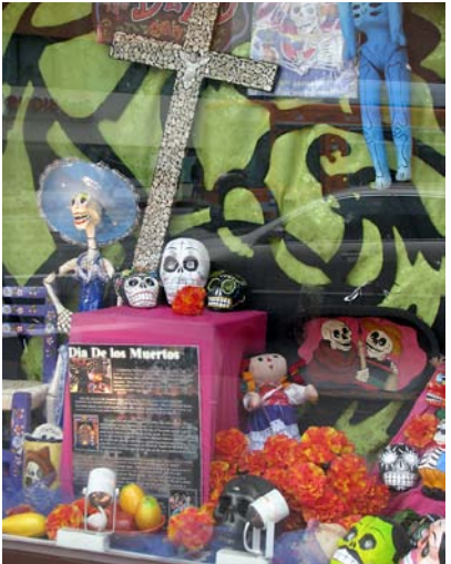
Dia De Los Muertos

part was that our parents took us out of school early so we could stay at the carnival once our dance was over, while other students stayed inside doing work.