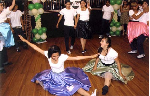
The surprise dance

A feast usually follows after the mass at either the family's home or at a banquet hall. At the feast, everyone eats and dances. The guests receive special party favors (recuerdos)