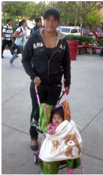
Student with baby at school

IN BOYLE HEIGHTS, TEENS HAVE TO DEAL with many issues. Many of us start having problems in high school, but for others it begins even earlier. Students start to drop out for many reasons: lack of motivation, lack of family support, drugs and