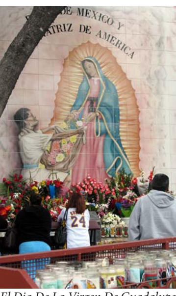
El Dia De La Virgen De Guadalupe

Another holiday we celebrate here in Boyle Heights is the day of the Virgin Mary, El Dia de la Virgen de Guadalupe. We celebrate her birthday and honor her