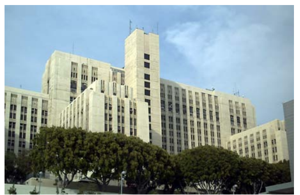
LAC/USC Medical Center

place where you can see our Hispanic culture is the gazebo on the Mariachi Plaza. The LAC/USC Medical Center, known to us as the General Hospital, founded in