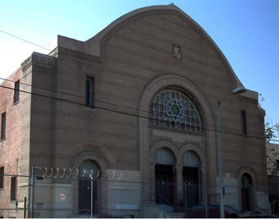
Breed Street Shul

Our present community is mostly Hispanic, so it's not a surprise to find architecture influenced by Latin America. One such building is La Casa Del Mexicano. This building can be seen on top of Blueberry Hill with its square shape and a dome on the roof. Another