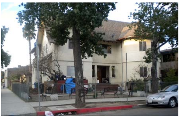
Mansion converted into apartments

In Boyle Heights there are many low-income people and for these struggling families the government has an agency called Housing and Urban Development (HUD). One of HUD's primary missions is to create a suitable living environment for all Americans by