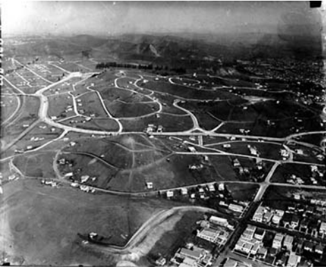
Early Boyle Heights

Many ethnically diverse people including Mexicans, Jews, Japanese, African Americans, Native Americans, and Hispanics, have lived in