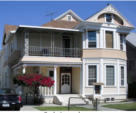
Boyle Avenue house

Hospital. Crossing Whittier Boulevard, we only see factories, warehouses, and the newest multi-apartment complexes. Looming at the end of Boyle Avenue is the Sears Tower, an ancient building that once was a functioning megastore, now reduced to a common department store.