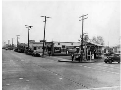
Ford Blvd. near Brooklyn Ave.