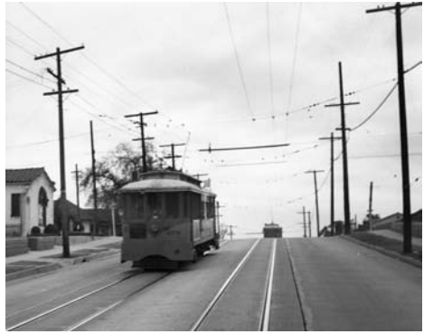
Boyle Heights Streetcar

What brings people here are the affordable houses and land. Boyle Heights has always been and always will be a place with many ethnicities and religious diversity. They come